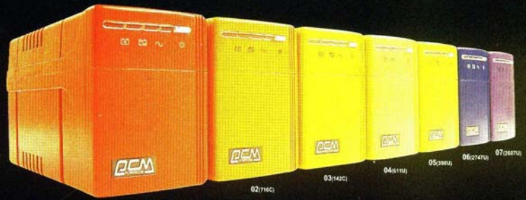
KIN-325A-ART / KIN-425/525/625A/AP-ART